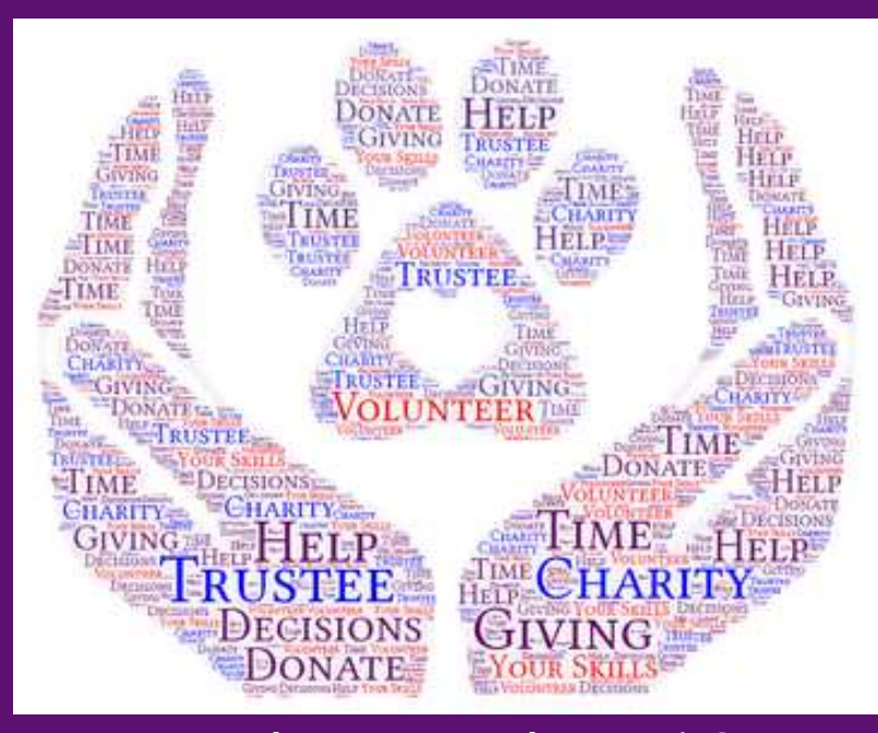
So there you have it!

It turns out you don't have to be "old" or "retired" to be a trustee!